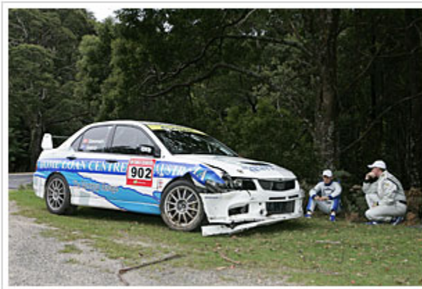
Whilst damage was relatively minor the time lost meant that a challenge for the win was impossible.